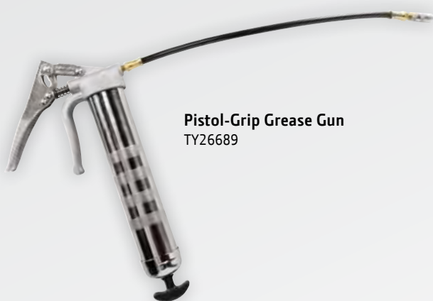
Pistol-Grip Grease Gun TY26689