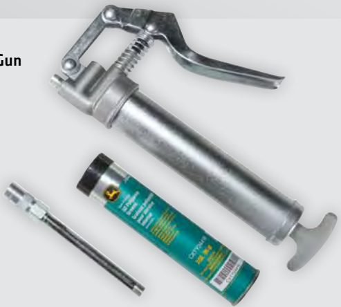
Mini Grease Gun TY26200

This small grease gun comes complete with two 85 gram (3 oz.) cartridges filled with John Deere all-purpose grease: