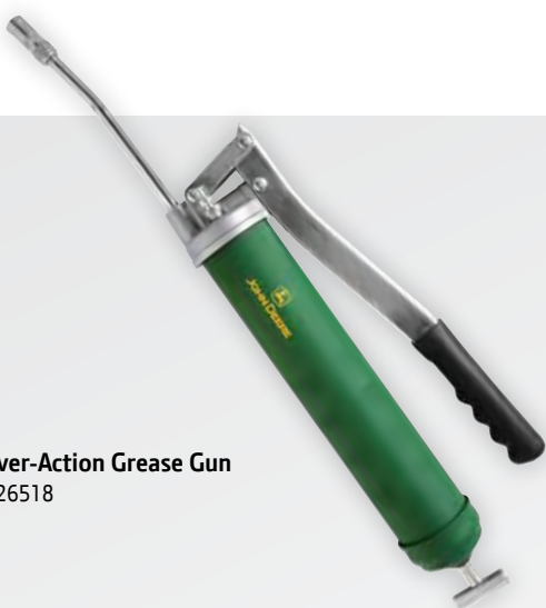
Lever-Action Grease Gun TY26518