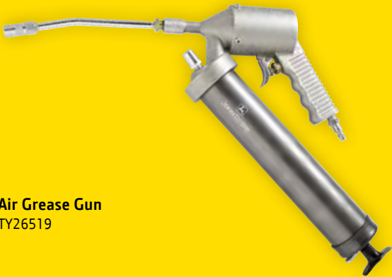
Air Grease Gun TY26519