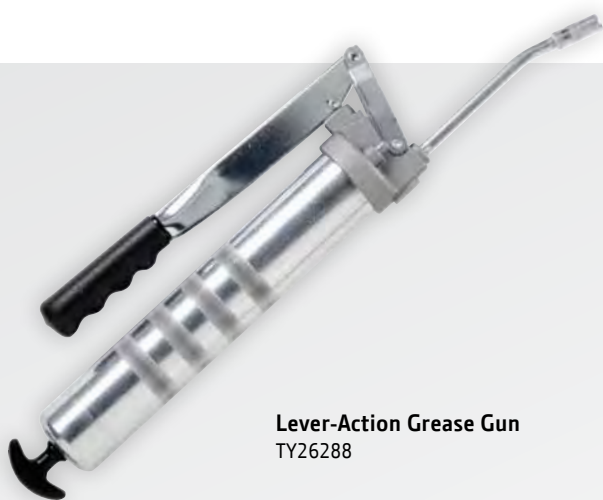
Lever-Action Grease Gun TY26288