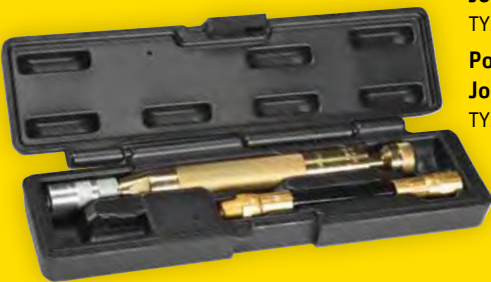
Professional Grease Joint Cleaner Kit TY26457