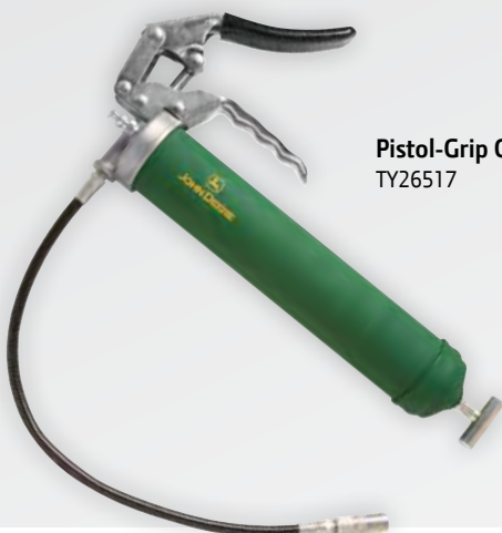
Pistol-Grip Grease Gun TY26517