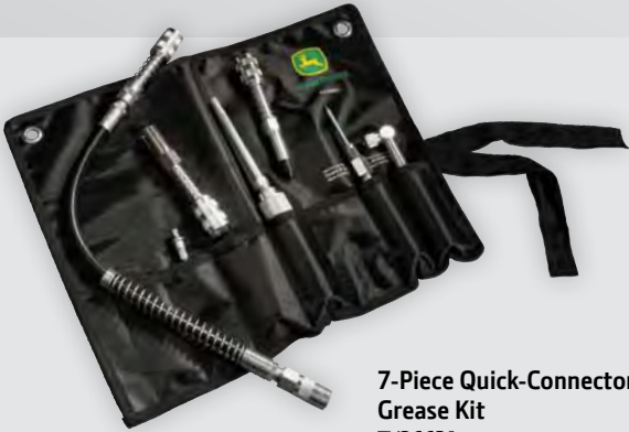
7-Piece Quick-Connector Grease Kit TY26631

The new 7-Piece Quick-Connector Kit is a simple and effective system that renders versatility to grease guns of all makes for quick and efficient greasing in inaccessible, difficult-to-reach areas. The components convert any grease gun fitted with a jaw-type coupler into a special-application greasing device. No threads, and no screwing or unscrewing... just snap on and use!